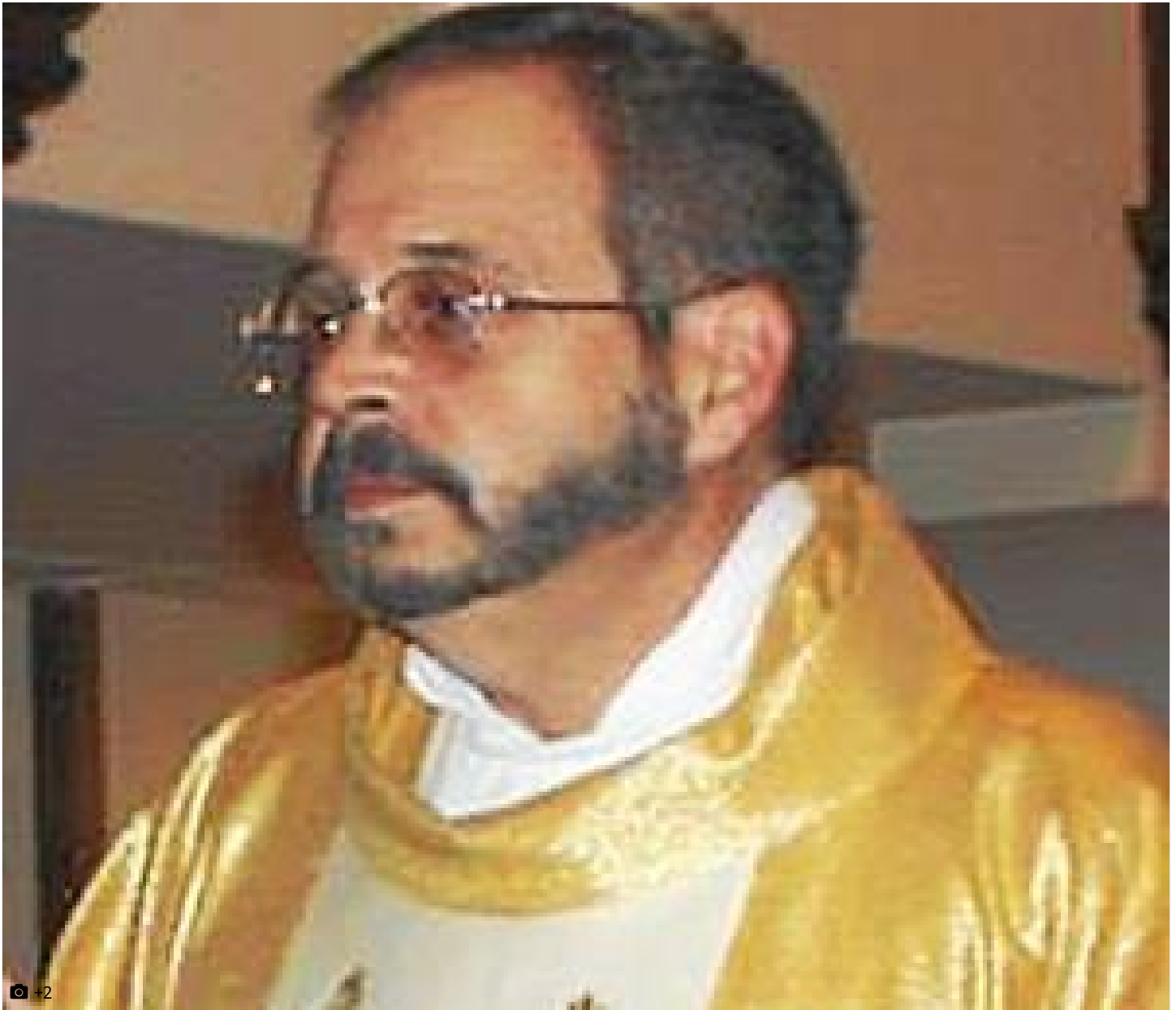
12 priests accused of sex abuse worked or lived in Mid-Hudson Valley